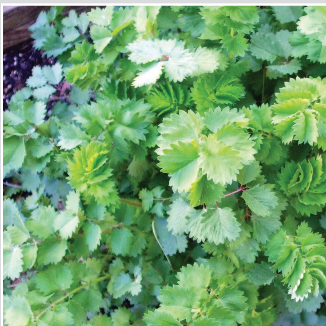
Salad burnet ( Sanguisorba minor )