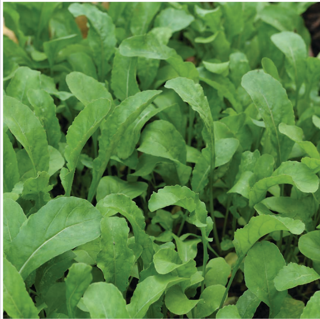
Rocket ( Eruca sativa )